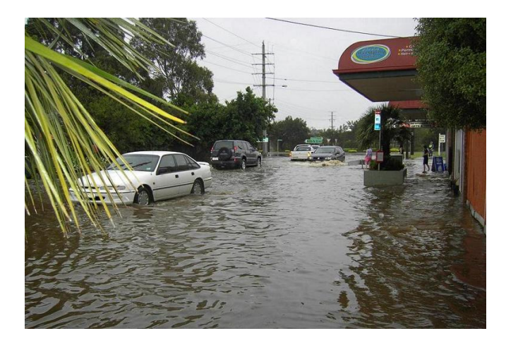
Flooding along Mackey Street.

Even a small amount of additional rain will flow over land and into properties in low lying areas of Longwarry, especially near