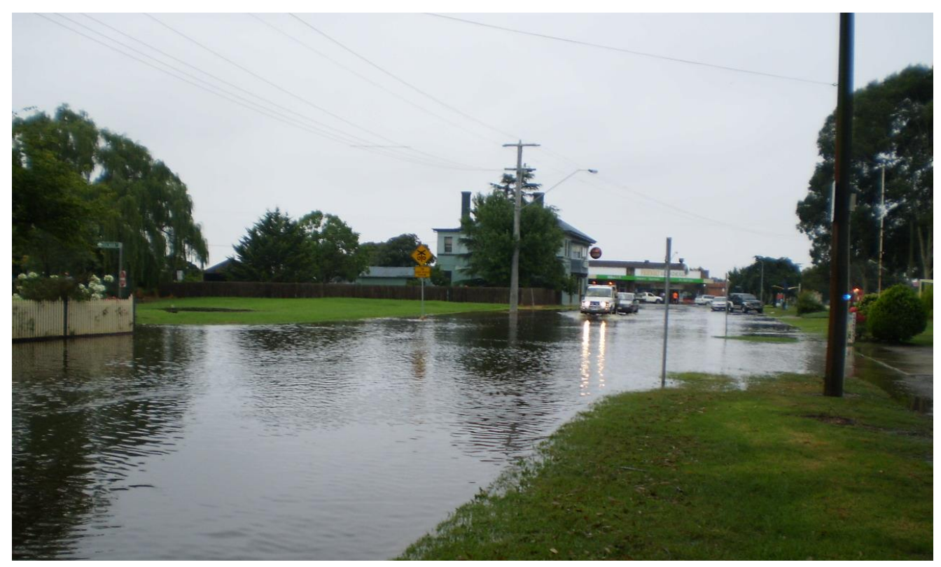
Flooding along Bennett Street

Local flooding information for Longwarry