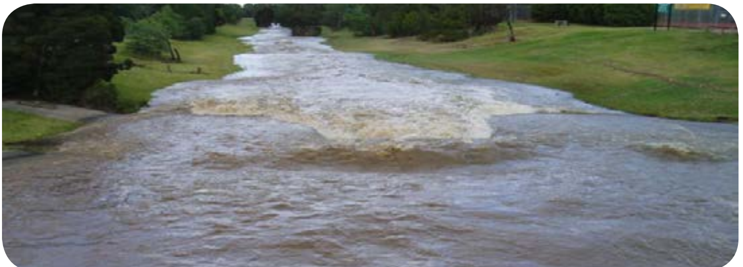
Blind Creek Flood February, 2005

Knowing what to do can save your life and help protect your property.