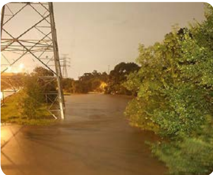
Great Valley Road, February 2011.

Knowing what to do can save your life and help protect your property.