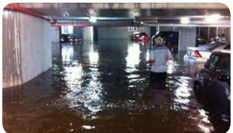
Underground residential carpark, 2011.

For more information aimed at business and emergencies visit the emergency portal: tsbi.com.au/resource-category/emergency-resource-portal/