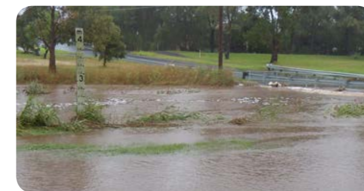
Flinders Avenue, 2011 flood. The Flood Gauge indicates a depth of water to 1.9 metres. During dry weather, the Creek height is around 0.4 metres.

Information about potential floods will also be available from SES. You can monitor rainfall and river levels on the BoM website at bom.gov.au