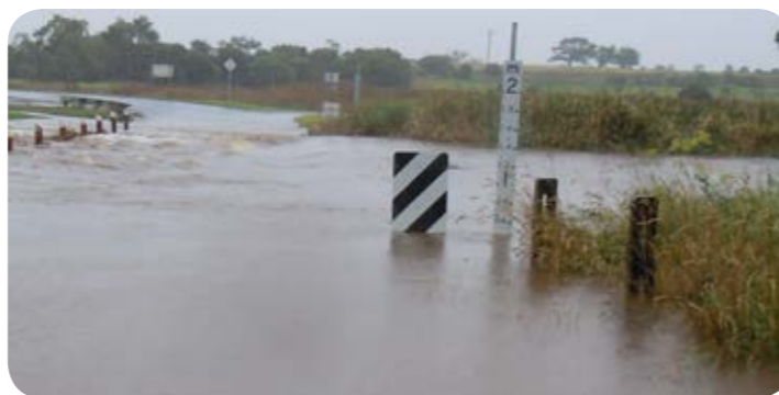
Rennie Street, 2011 flood. The flood gauge indicates a depth of water over the road height of 0.4 metres.

Knowing what to do can save your life and help protect your property.