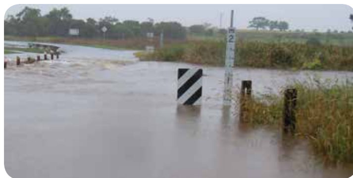
Rennie Street, 2011 flood. The flood gauge indicates a depth of water over the road height of 0.4 metres.

Knowing what to do can save your life and help protect your property.