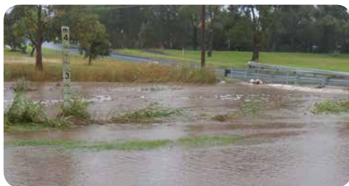
Flinders Avenue, 2011 flood. The Flood Gauge indicates a depth of water to 1.9 metres. During dry weather, the Creek height is around 0.4 metres.

Information about potential floods will also be available from SES. You can monitor rainfall and river levels on the BoM website at bom.gov.au