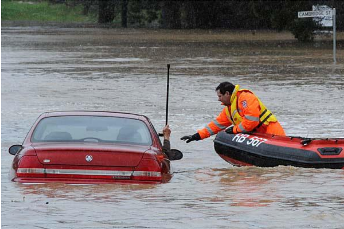
A motorist being rescued by VICSES in Shepparton during 2010 floods

Ten years after La Nina generated flooding caused $1.3 billion damage, the Victoria State Emergency Service (VICSES) reflects on the devastating impacts, and powerful stories from those that responded.