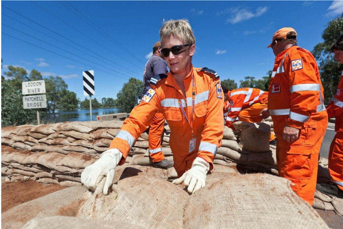
A powerful La Nina system caused serious floods on the Loddon River in 2011 (VICSES)

Ten years after La Nina generated flooding caused $1.3 billion damage, the Victoria State Emergency Service (VICSES) reflects on the devastating impacts, and powerful stories from those that responded.