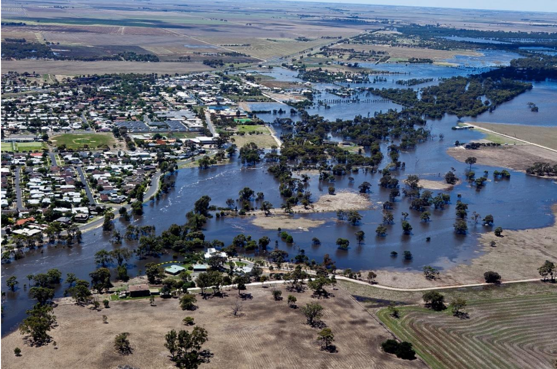
Horsham was 'split in two' by the devastating 2010/11 floods

Ten years after La Nina generated flooding caused $1.3 billion damage, the Victoria State Emergency Service (VICSES) reflects on the devastating impacts, and powerful stories from those that responded.