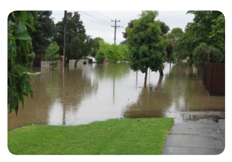
King Street, Pakenham

Even if you are not directly affected, you may still need to detour around flooded areas.