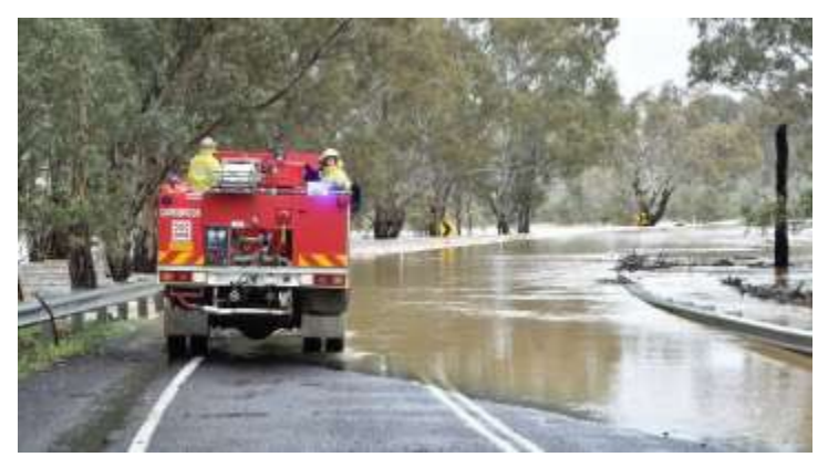
Carisbrook September and October 2016