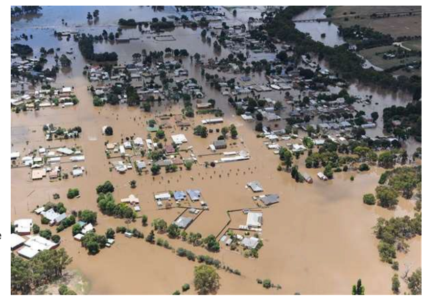
Carisbrook aerial photo, January 2011

Flooding was severe and fast with most of the floodwater receding within eight hours. While no two floods are the same, floods like this or worse could occur again. It is important for residents to be aware of the potential for future flooding and plan for it.