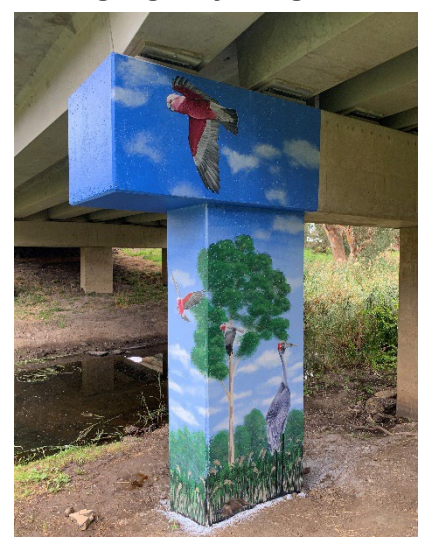
Glenelg Highway Bridge pylon mural by Jimmy Buscombe (Corangamite Shire)

In 2022, a mural artwork was completed on the south-eastern pylon of the Glenelg Highway Bridge on Montgomery Street. The mural features a platypus, a brolga, and a flock of galahs on a background of gum trees and river reeds.