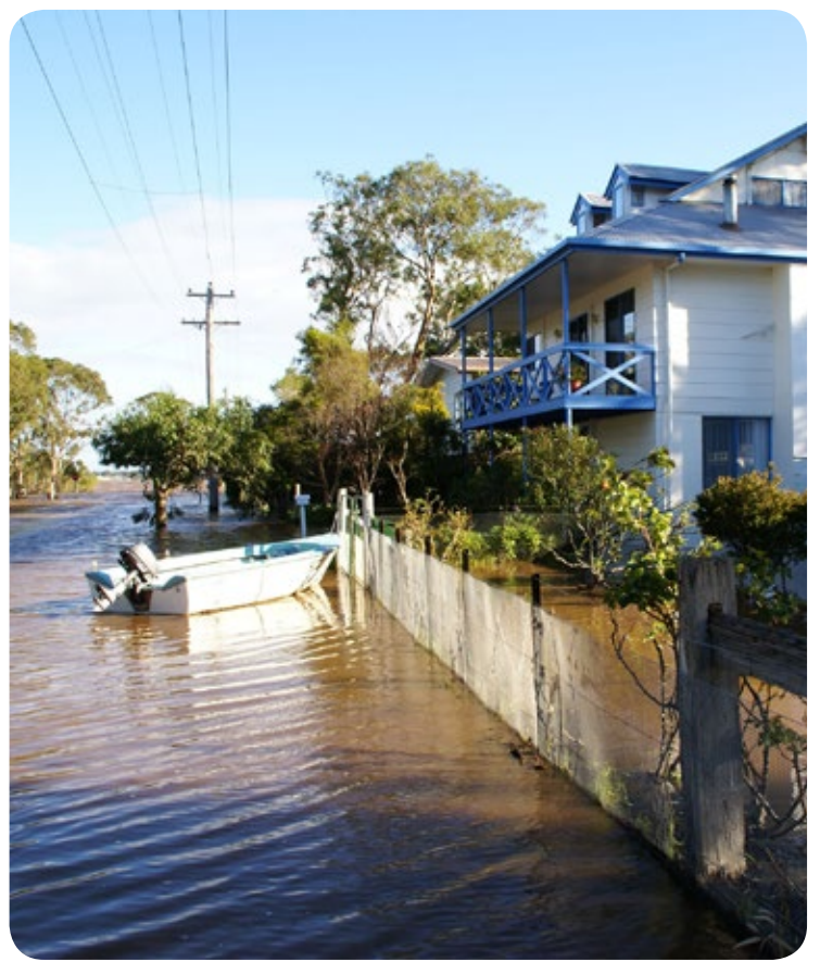
Raymond Island, 2007