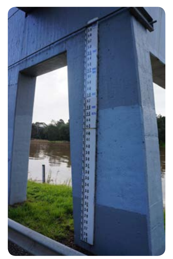
McIntyre Bridge River Heights Gauge