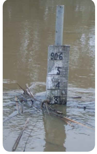
River level gauge at Quambatook, which is similar to what will be installed in Creswick.

This gauge helps you to observe how quickly water is rising or falling in future floods. The gauge should be monitored for the peak of the flood event to record a flood history of Creswick.