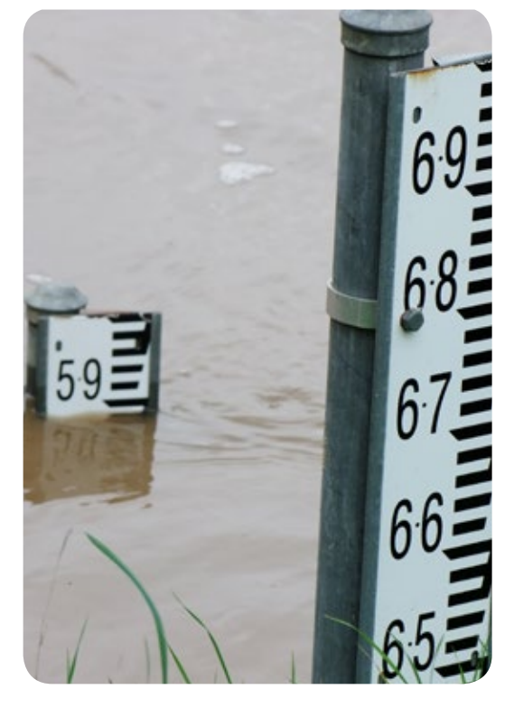
An example of a flood gauge

Below minor flood level, the Goulburn River breaks its banks causing flooding on low-lying farmland, parkland, low-lying roads and river crossings.