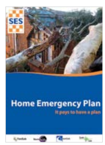
Visit ses.vic.gov.au to obtain a copy of your Home Emergency Plan workbook