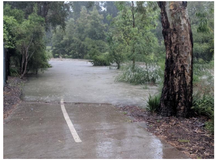
Scotchmans Creek Trail, Glen Waverley, December 2017