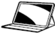
Tablet or computer