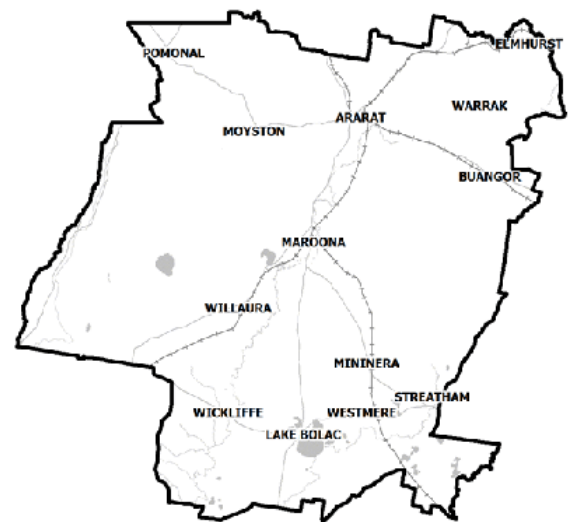
Ararat Rural City Council municipal map.